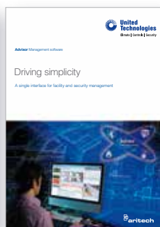
Advisor Management software brochure