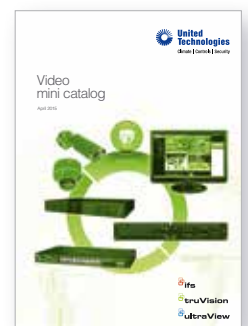
Video product range mini catalogue