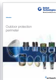
Outdoor protection perimeter brochure