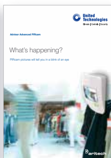
Advisor Advanced PIRcam brochure